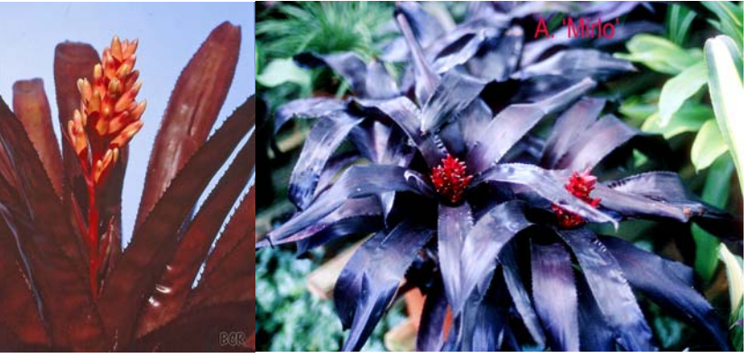
A. 'Mirlo'(?) 1984 photo from California collection A. 'Mirlo' in Australia

The BCR photos for A. 'Mirlo' showed a plant similar to my "unknown" plant, with