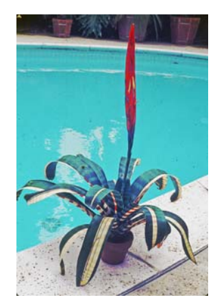
variegated Vriesea splendens

The photograph in column 2 of a variegated V. splendens was taken at Jeffrey's pool in 1975.